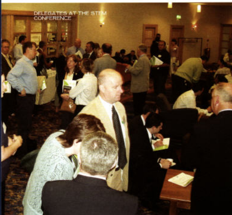
DELEGATES AT THE STEM CONFERENCE